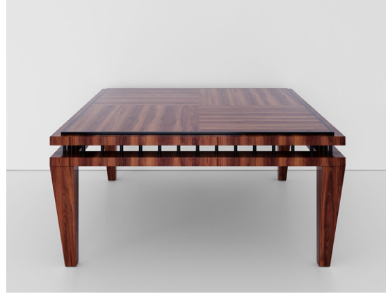
American or European walnut