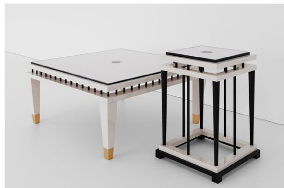
cream/ black varnish