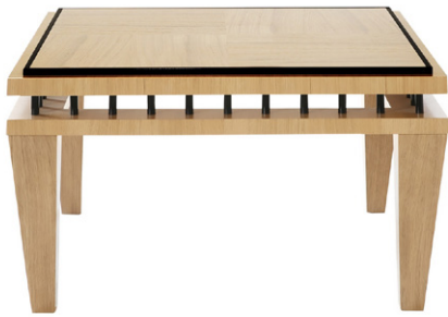
natural straight-grained oak