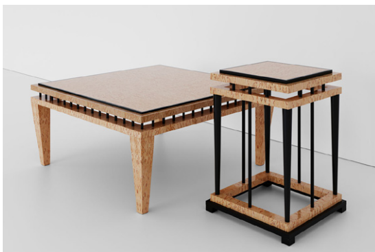
Curly birch burr