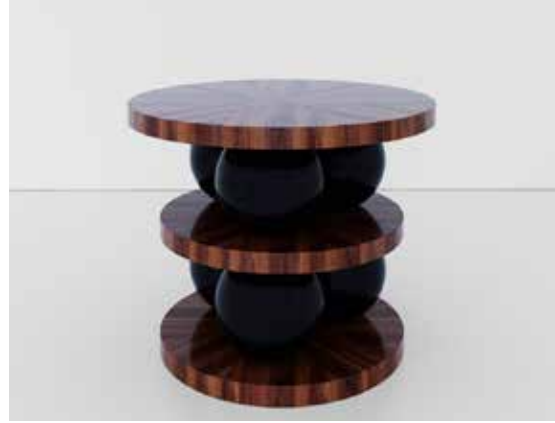
American or European walnut