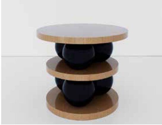
natural straight-grained oak