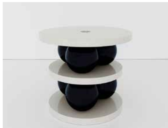
cream/ black varnish