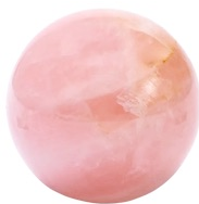
honey calcite ball