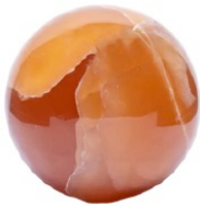
pink quartz ball